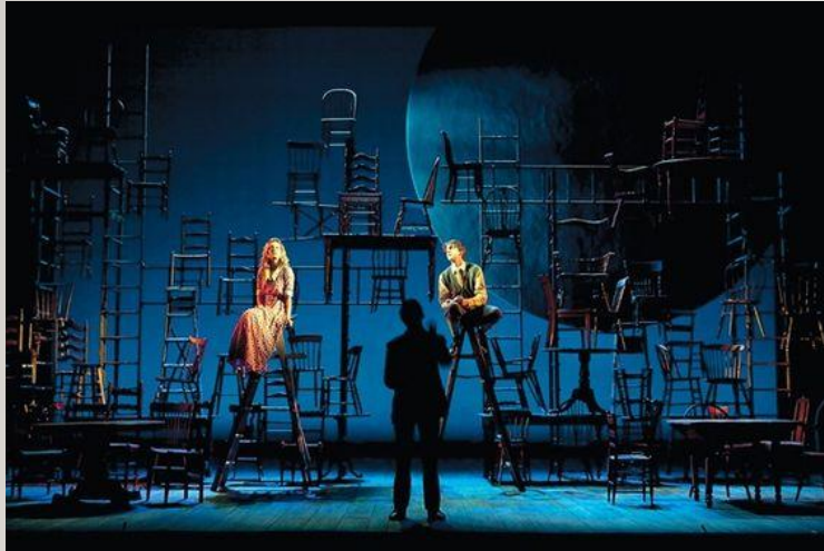
Williamstown Theatre Festival's