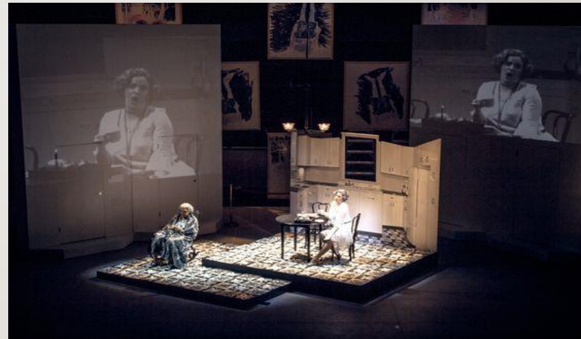
Baden Baden 1927. Gotham Chamber Opera. Scenic design by Court Watson, lighting by Driscoll Otto